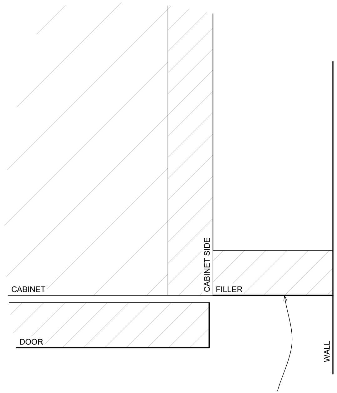
FILLER TO ALIGN WITH CASE